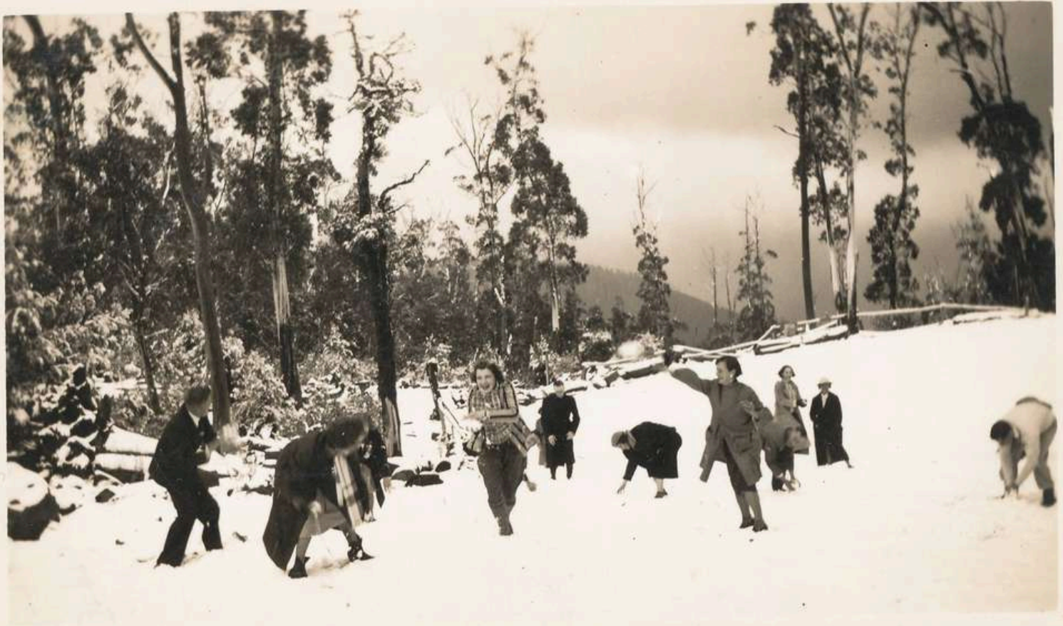
SNOW FUN AT MT.DONNA BUANG