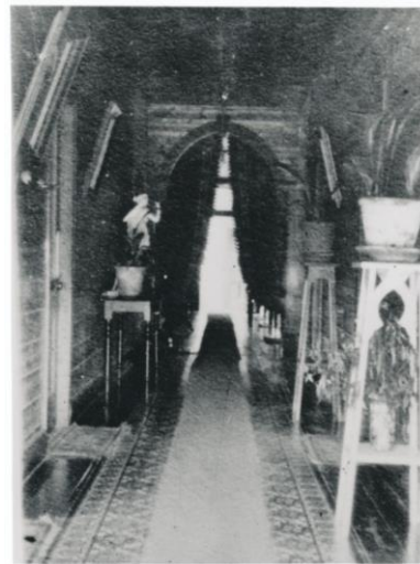
Just two of the photos discovered unscanned. A Gentleman relaxing on the front verandah of McVeigh's Hotel, pre 1936. An Interior photo of the McVeigh's Hallway.